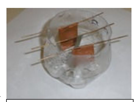
Figure 1: Electro deposition Cell